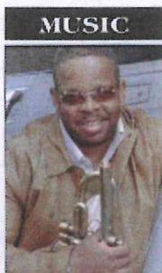
Jazz at the Loberos to present Grammy Award-winning tromper, Terence Blanchard