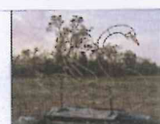
Swan, City Park, New Orleans, photograph by Neil Campbell at the Arts Festival Gallery