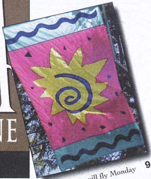
Solstice Flags will fly Monday 9