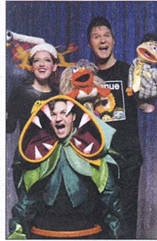
From Forbidden Broadway at the Granada Theatre