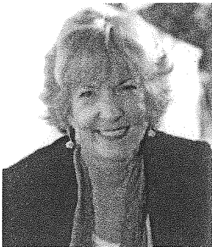
Sue Grafton

Cousteau has spent most of his adult life nurturing the work of his famous father and now, in his newest book, My Father, the Captain , he gives us an intensely personal look into the lives of the Cousteau family. Click here for more information.